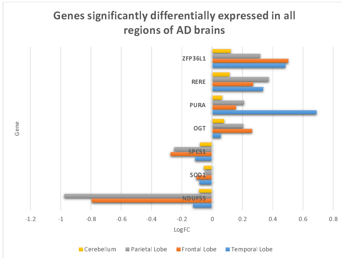
Figure 3: Seven genes consistently significantly differentially expressed in the same direction in all regions of AD brains but not in Schizophrenia, Bipolar Disorder, Huntington's disease, Major Depressive Disorder or Parkinson's disease brains. These seven genes can be assumed to be unique to AD brains, and may play an important role in disease mechanisms.