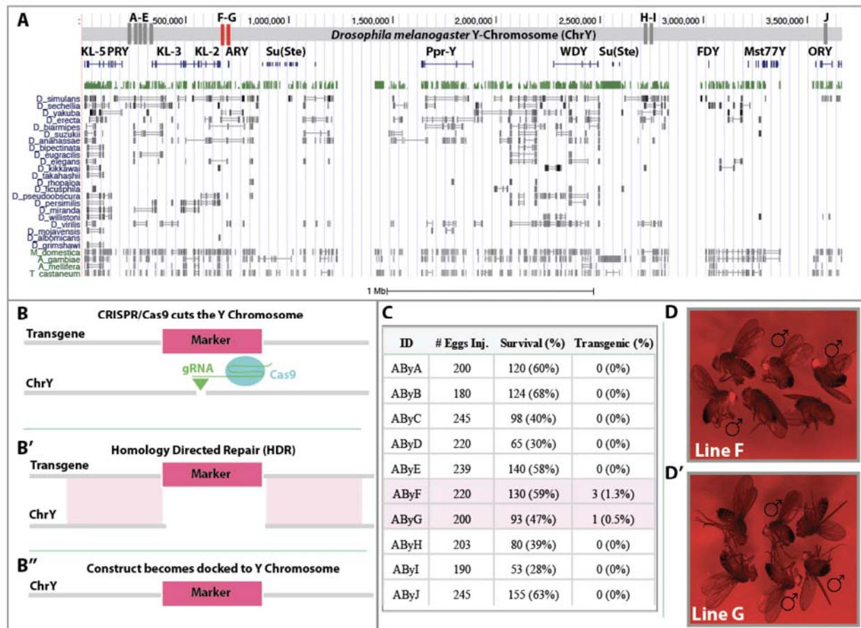
Figure 1. Targeted transgene insertion on the D. melanogaster Y-chromosome. (A) A map of the D. melanogaster Y-chromosome (adapted from the UCSC Genome Browser) shows the position of attempted transgene insertions (vertical bars labelled A-J; red bars indicate successful insertions, while grey bars indicate insertion failure) relative to the location of major genes. Conservation of gene regions in 26 other species is also indicated. (B) A schematic of the basic transgene utilized is shown. The transgene contains a marker flanked by homology arms to a specific region of the Y-chromosome, and is injected with a sgRNA that targets a sequence on the Y-chromosome between the homology arms, and a source of Cas9 (B). Following a Cas9-induced double-strand DNA break (DSB), the cell's homology-directed repair (HDR) pathway utilizes the transgene as a repair template to copy the marker between the regions of homology (B'), generating a Y-chromosome with a marker gene at the precise sgRNA-targeted site (B''). (C) The number of embryos injected for each of the Y-chromosome targeting transgenes, survival to larval stage of injected embryos, and transgenesis rate (# of independent transgenic individuals found/# of embryos injected) is shown. (D) All males (and none of the females) for each of the two recovered transgenic lines (AByF (D) and AByG (D')) express eye-specific red fluorescence.