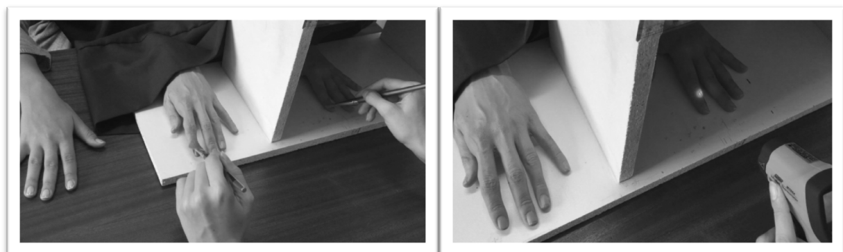
Figure 1. The set up for the RHI requires that the participant is not able to see their real left hand while the prosthesis is in clear sight. For proprioceptive judgements, participants were questioned about the current location of their hand relative to position “1”. Temperature readings by infra-red thermometer were taken from location “2”. The box measured 40cm in width, 28cm in height and 23cm in depth.

The RHI was carried out in accordance with standard procedure (Tsakiris & Haggard, 2005) and operationalised in terms of a self-report questionnaire, measures of proprioceptive drift and temperature change in the experimental limb. The researcher and participant sat opposite one another at a table, separated by a rectangular box with openings on either side so that the researcher could see the participant's left hand resting inside the structure (See Figure 1). The rim of the top surface of the box on the side facing the experimenter included a ruler to track hand position estimates. A life-like, plastic, left-hand prosthesis was placed next to the box in the same orientation as the participant's real left hand at a distance of approximately 30cm away. Prior to placement, participants were presented with three prostheses, differing in terms of skin shade, and asked to select for use the one which they felt most closely resembled their own skin colour. A dark smock was draped over the participant's shoulder to hide the position of their real left arm, leaving only the rubber hand visible.