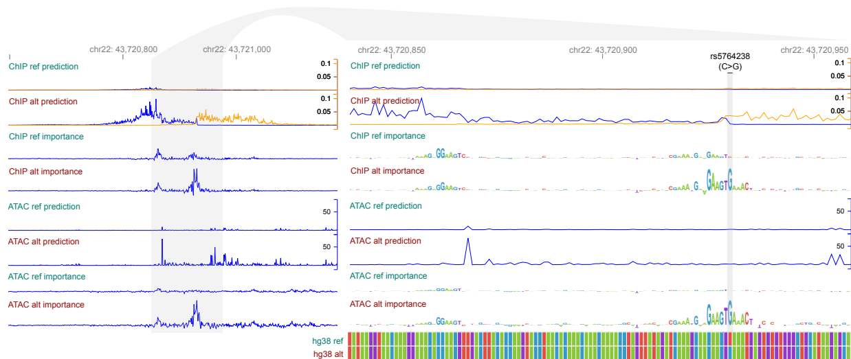
Figure 2. Resgen/HiGlass browser session for model-guided, non-coding variant interpretation

Zoomed out (left, hg38 chr22:43720597-43721177) and close-up (right, chr22:43720840-43720958) views of predicted base-resolution coverage profiles (as BigWig tracks) and nucleotide importance scores (as dynseq tracks) from BpNet models of SPI1 ChIP-seq and ATAC-seq data for a genomic sequence containing the reference (C) and alternate (G) allele of the rs5764238 genetic variant, previously identified as a SPI1 binding QTL. For ChIP-seq predicted tracks, blue tracks denote the plus (+) strand coverage and orange tracks denote the minus (-) strand coverage. The G allele is predicted to increase SPI1 ChIP-seq and ATAC-seq signal by creating a strong SPI1 motif, as seen in the dynseq tracks.