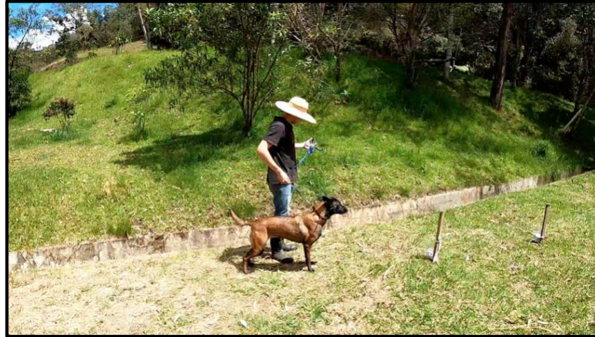
Supplemental Movie 1: This video illustrates the experimental field as described in the text. Vika is displaying a perfect performance during the PII training.