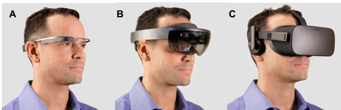
Figure 1. Head-worn Computers or Displays. (A) Glass Explorer Edition (originally known as Google Glass): augmented reality (AR) smartglasses with fully stand-alone onboard computer (weight 42 grams). (B) Microsoft Hololens: AR headset with fully stand-alone onboard computer and depth camera (weight 579 grams). (C) Oculus Rift: virtual reality (VR) headset display, which must be tethered continuously to a powerful computer to drive it (weight 470 grams). VR headsets and some AR devices are large, heavy, and block the social world considerably.

thought to make VR technology well suited to the creation of learning tools for people with ASD (20), including being a primarily visual and auditory experience, being able to individualize the experience, and promoting generalization and decreasing rigidity through subtle gradual modifications in the experience (20).