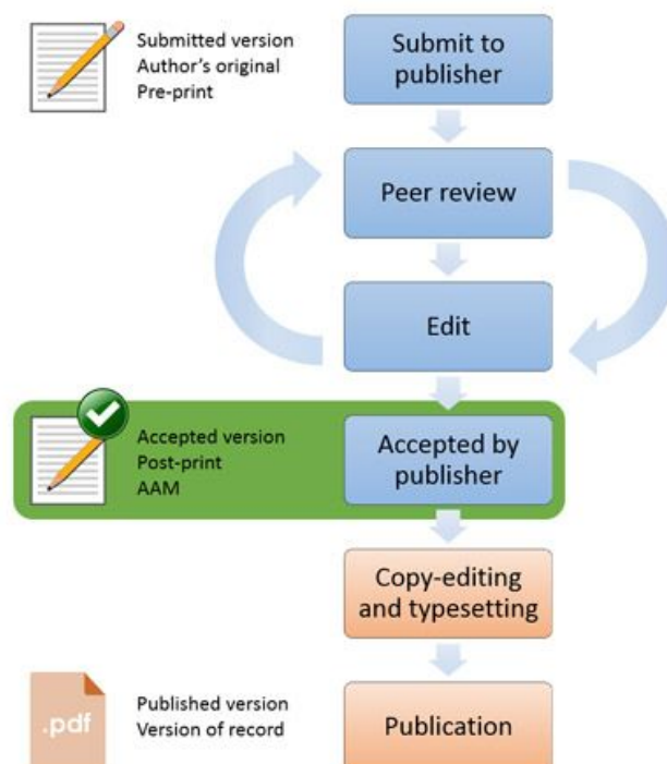
Figure 1. Publishing outline from HEFCE http://www.hefce.ac.uk/rsrch/oa/FAQ/

Following publication, however, the traditional scholarly communications process gives way to “best practices.” For concerns raised about an article, or author-initiated changes, there