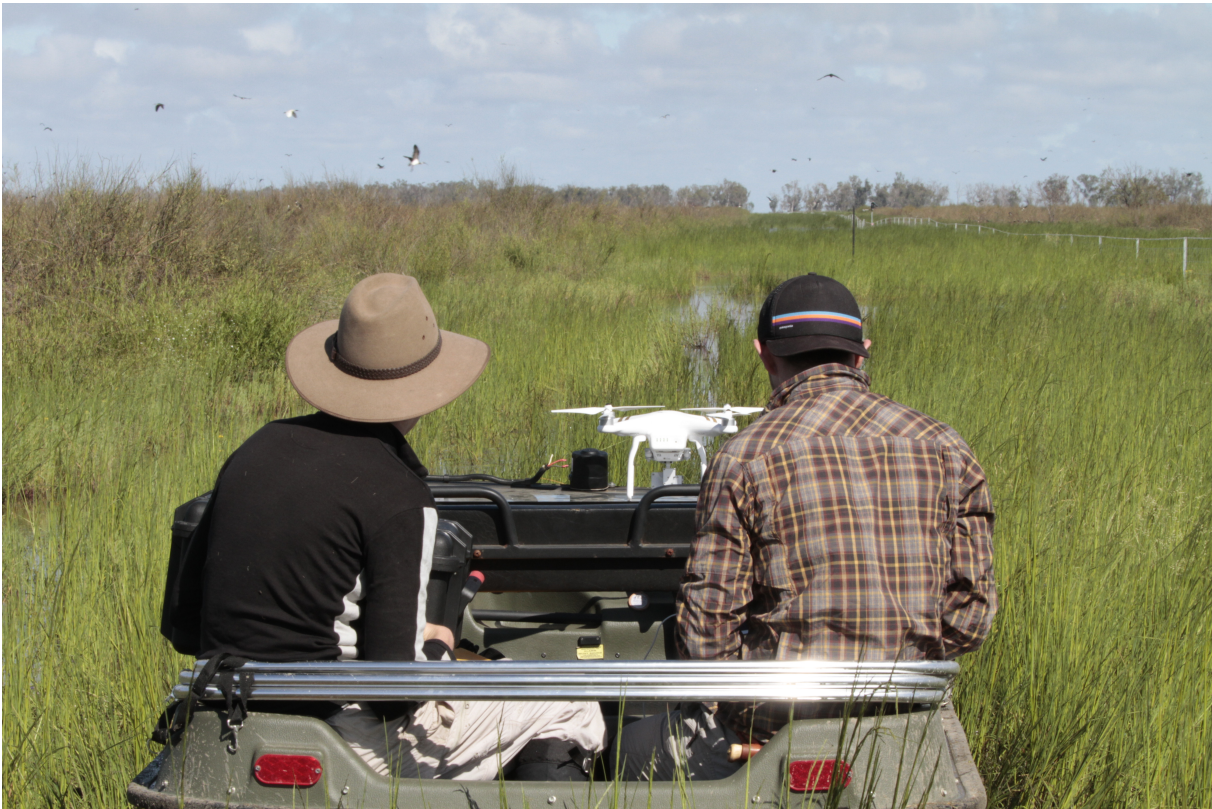
Figure 2: Quad-copter ( DJI Phantom 3 Pro ) launch from an amphibious vehicle ( Argo 8x8 650 ) at a straw-necked ibis colony on the Lower Lachlan River in New South Wales, Australia.