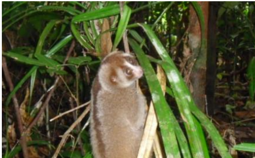
Fig. 1 Slow loris in Matang Wildlife Centre (Aug 2009)

In this paper I aim to give an overview of what has been published (reference date August 2016) on rehabilitation and release programs of captive slow lorises, in order to increase the number of future successful translocations in Sarawak, Malaysian Borneo. The four main questions of this review paper are: