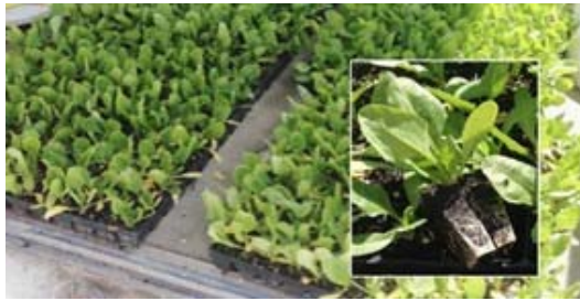
Figure 1: Thirty-eight-day-old fodder beet (cultivar 'Rivage') seedlings in model 144 Transplant Systems cell trays.