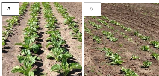
Figure 2: Transplanted (a) and precision drilled (b) fodder beet (cultivar 'Rivage') plots at the New Zealand Institute for Plant & Food Research, Lincoln, in 2014.

It is important to note that the precision-drill rate of 110,000 seeds/ha to achieve the average 95,000 plant/ha in this experiment was higher than what farmers use in their fields (i.e. drill 100,000 seeds/ha to achieve 80,000 plants/ha). Thus, while a high plant population and yield comparable to the transplanted crops was achieved in this experiment, it was far from the 15.9 t/ha observed in a recent trial (Milne et al. 2014).