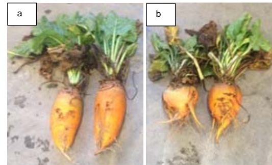
Figure 3: Transplanted (a) and Precision-drilled (b) fodder beet ('Rivage') plants at harvest. The forked root system (sprangling) of the transplanted crop is obvious and in spite of an apparent visual volume difference dry matter yields were similar.

The extra speed of growth and higher potential yield, particularly as indicated by intercepted radiation (Fig. 5), is commonly reported in sugar beet transplant trials. The most likely yield increase arises from both quicker leaf canopy closure, reduced weed pressure and particularly the potential to raise seedlings earlier than is feasible by direct seed-sowing in the field. In this proof of concept trial we did not attempt to exploit this earlier plant germination component offered by transplanting.