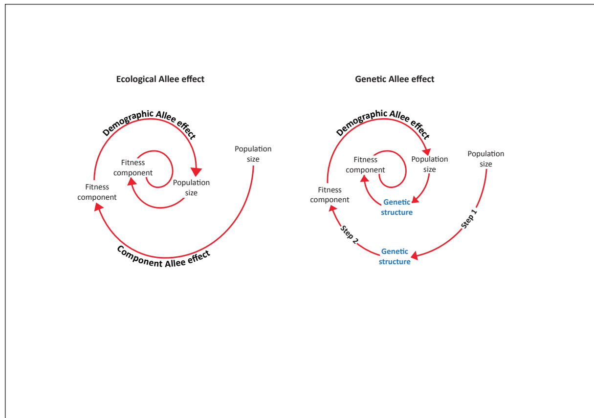
Figure 3. Extinction vortices driven by Allee effects. In ecological Allee effects, a decrease in population size directly causes a decrease in a component of individual fitness, which may in turn yield a decrease in population growth rate. A genetic Allee effect is a two-step process. A decrease in population size induces a change in the genetic variation of the population via inbreeding, drift/selection balance or migration (Step 1). This change yields inbreeding depression, drift load or migration load, causing a decrease in the value of fitness components (Step 2). Both ecological and genetic component Allee effects can produce a demographic Allee effect, which, if strong, can generate an extinction vortex.