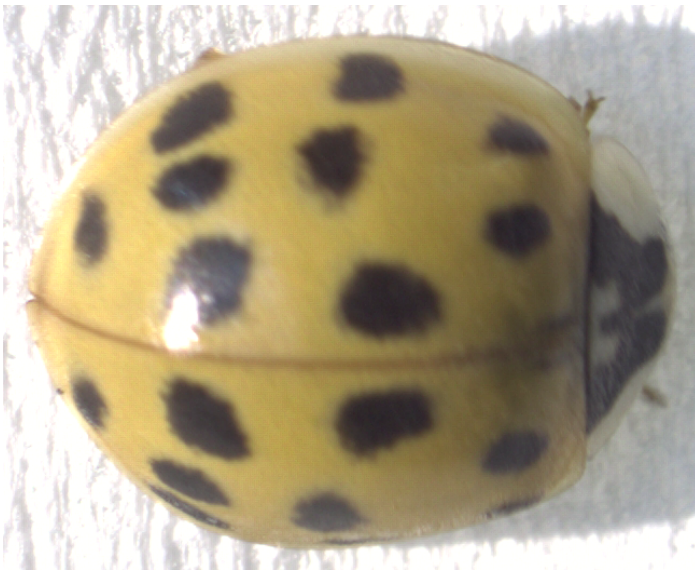
Figure 1b: The adult used for transcriptome sequencing.