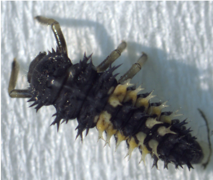
Figure 1a: The larva used for transcriptome sequencing.