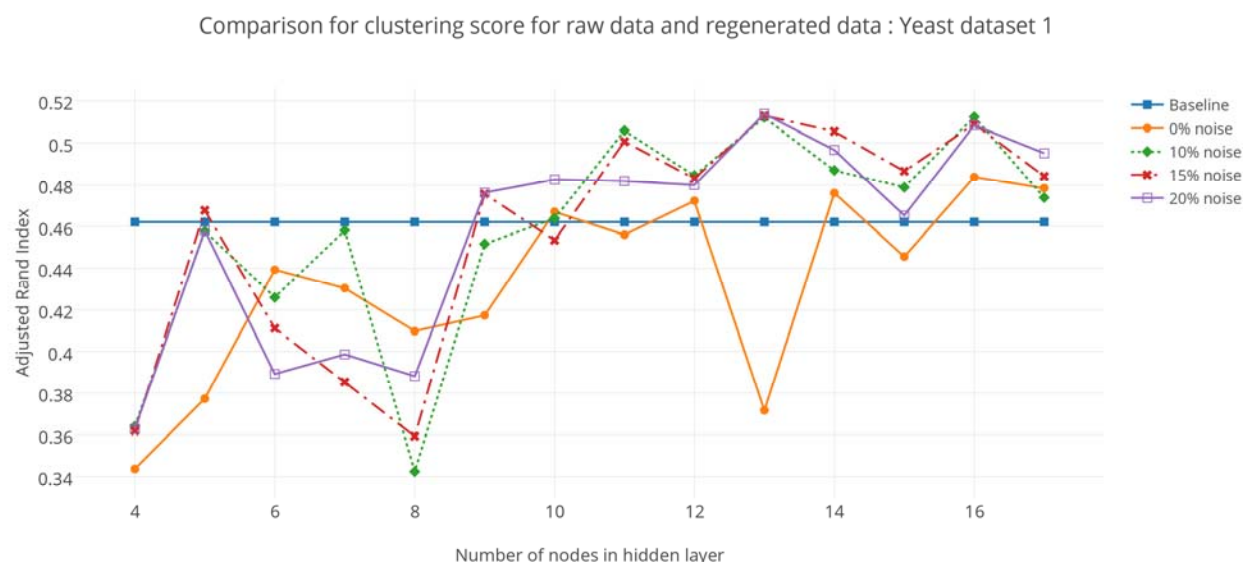
Fig. 2. Performance comparison of raw data of yeast dataset 1 and samples regenerated from the trained network on the task of clustering.

Our experiments had a lot of parameters that required tuning. We considered different factors like batch size, number of training epochs, number of nodes in the hidden layer, corruption level and learning rate for SGD. Choosing the right set of parameters for a neural network is a difficult problem. A general rule of thumb is to not let the size of the hidden layer go below a certain threshold. This can be argued by considering the lossy compression that is achieved with a small hidden layer. Another rule of thumb used is to let the size of the hidden layer be equal to the number of principal components that capture the majority of the variance in the data. The most popular method to choose hidden layer is k-fold cross validation for a set of candidate hidden layer sizes. Care must be taken, however, to avoid overfitting to training data.