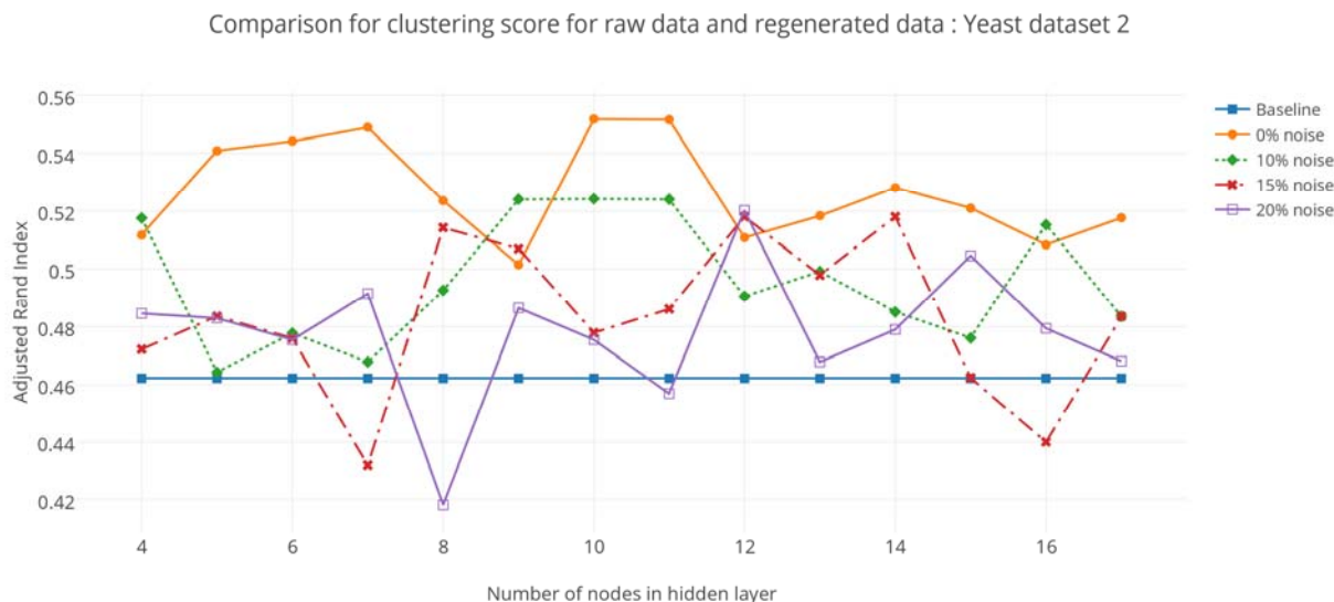
Fig. 3. Performance comparison of raw data of yeast dataset 2 and samples regenerated from the trained network on the task of clustering.