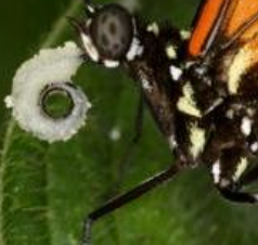
Figure 1 A