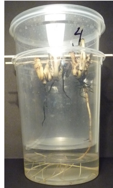
Fig. 1 Four seeds suspended on wooden sticks, were cultivated in plastic containers. They were sprayed with the solution two or three times a day. Such spraying leads to severe browning, and, if lateral roots appear, they soon also die. But in a rare event here, one primary root survived and continued to grow, not producing lateral roots. It went through a small hole in the bottom of the upper container to the solution below, reaching 11 cm in length. At this point, it started producing lateral roots in the part immersed in the solution. This photo was taken 20 days after soaking the seeds.

The primary root in Fig. 1. was only slightly affected by browning, but in the 7 days that it was growing in moist air, or at any time during the 20 days, it did not produce LR in air. The multiple LR, however, appeared after 2 days under the water. This cannot be explained solely by the effect of browning or the absence of such.